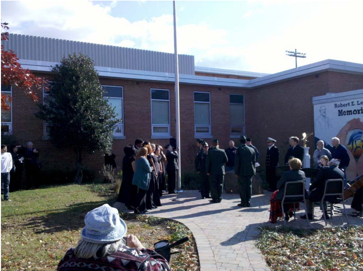
Jr ROTC raised the flag