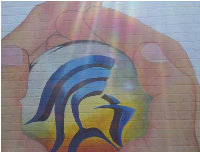
Close-up of hands with stylized Lancer helmet