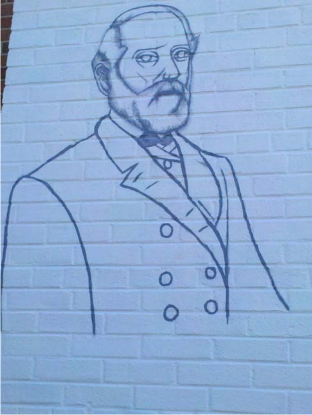
Close-up of R.E. Lee