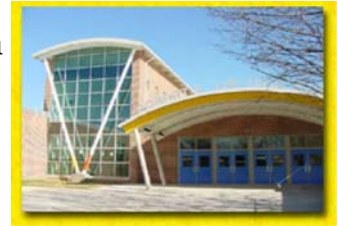
New front entrance of R.E. Lee High School

Did you know Lee went through major renovations recently? If you have not been by in a while, you wouldn't even recognize the lobby! You can get a tour of the newly renovated Lee High School when you purchase your ticket to the LAFA 50 th Anniversary Extravaganza. Meet at the front entrance.